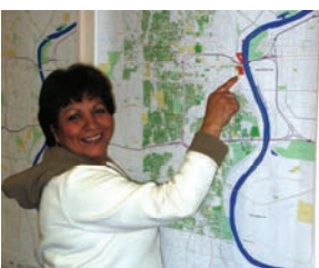
EPA Public Information Center, South Location