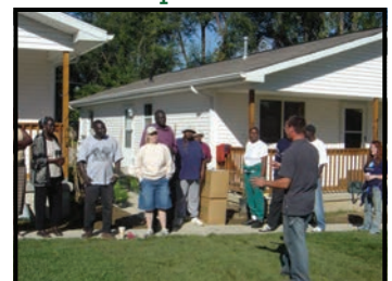
UNL -Extension - Douglas and Sarpy Counties