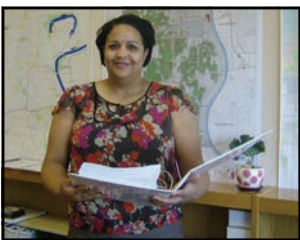
EPA Public Information Center, North location